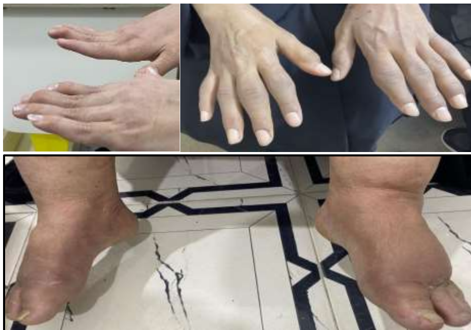
Figure 3. signs and symptom of RA in the study patient