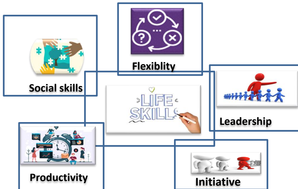
Figure3: Life skills component of 21st-century skills

Life Skills in the 21st-century classroom: