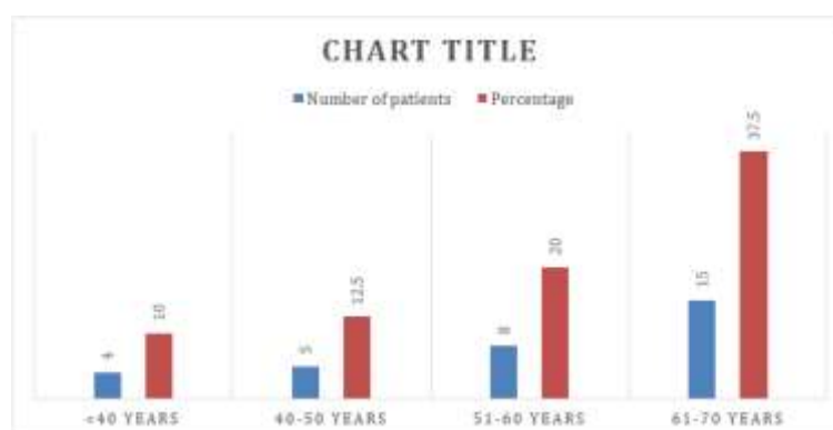
Figure 2: Bar Diagram showing distribution of age group

The mean age of the patients was 58.2 years.