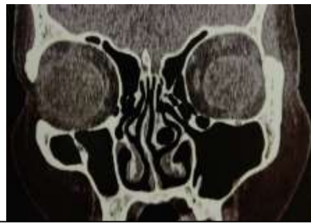
CT PNS SHOWING LEFT SIDE DNS WITH CONCHA BULLOSA