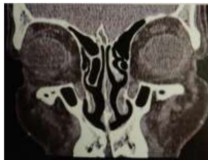
CT PNS SHOWING RIGHT SIDE CONCHA BULLOSA