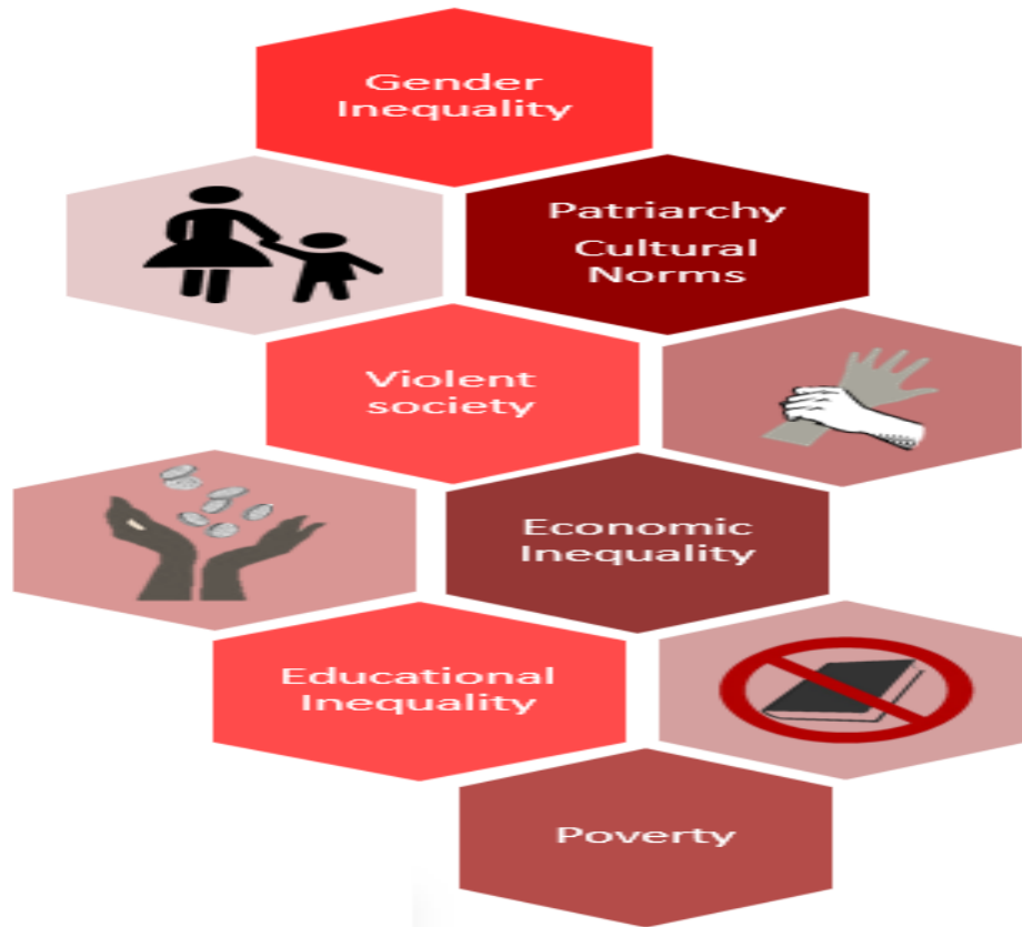
Figure 2: CAUSES OF GENDER-BASED VIOLENCE

The above figure, shows the magnitude of the problem amongst women, especially those divorced or widowed and those not married but living with partners. The statistics show that 40% of reported cases of abuse to those who have divorced and separated. Only 4% of reported cases of abuse for couples that are still together. These statistics of 2016 have changed significantly and today's statistics show high numbers. This report led to the investigation of the causes of gender-based violence. Figure 2 below provides a brief response to the causes of gender-based violence in 2016. It was important for this study to look at the background of what happened 5 to 6 years ago. It was necessary because evaluating the progress can come closer to the solution to ending gender-based violence.