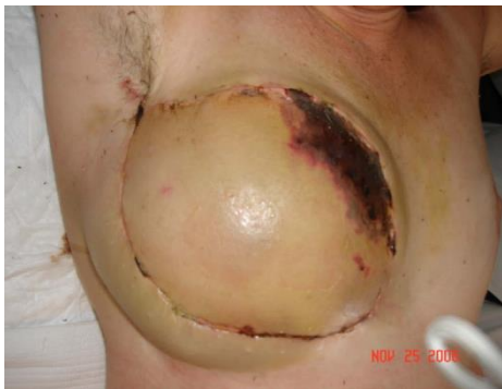
Figure 4. Reduction of the suffering area 5 days after the application of the plaster.