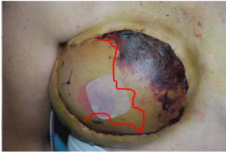
Figure 2. The flap 24 hours after the application of nitro-glycerine plaster.