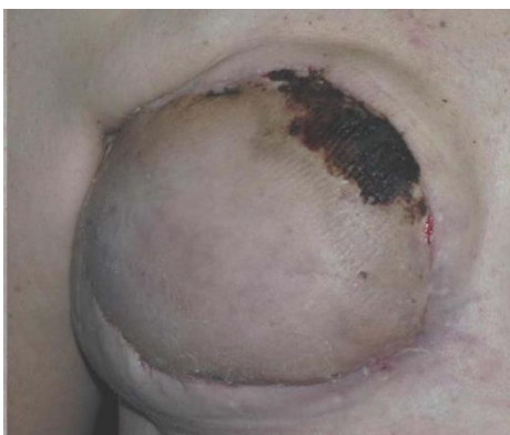
Figure 5. The reduction of the suffering area 6 days after the application of the plaster.