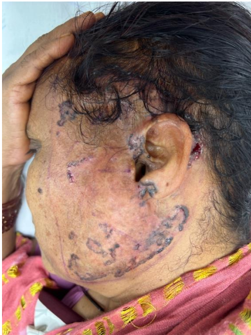
Figure 1: Irregular plaques with hyperpigmentation and peripheral crusting in curvilinear shape

mandible involving peri aural area of approximate size 8 cm x 6 cm with minimum scarring and atrophy (Figure 1). On palpation it was non tender, indurated with sensation intact.