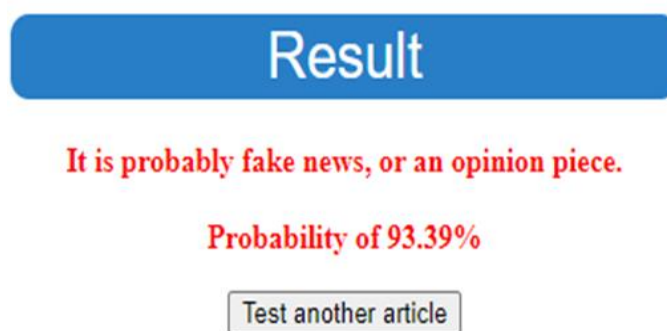
Fig. 4: Result with Accuracy