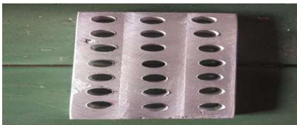
Fig. 1. Surface roughness composites samples of Al-Mg-Cr alloy reinforced nano WC ceramic particulates